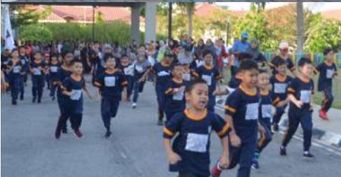
AIUIS Cross Country