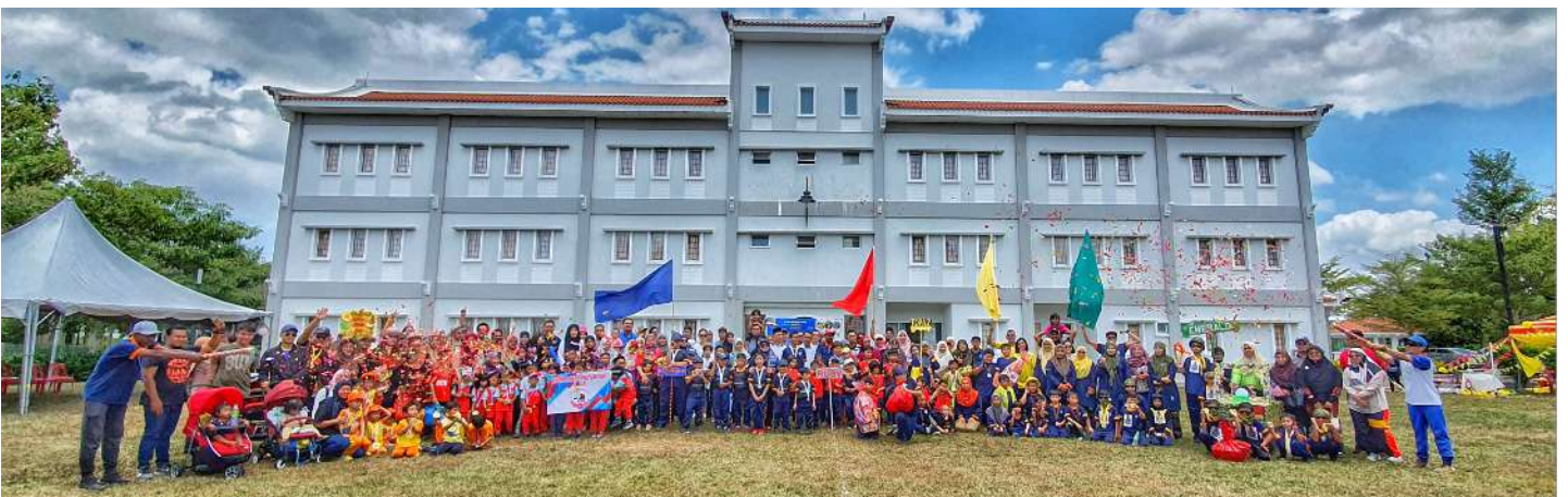
5th Annual Sports & Carnival Day 2020