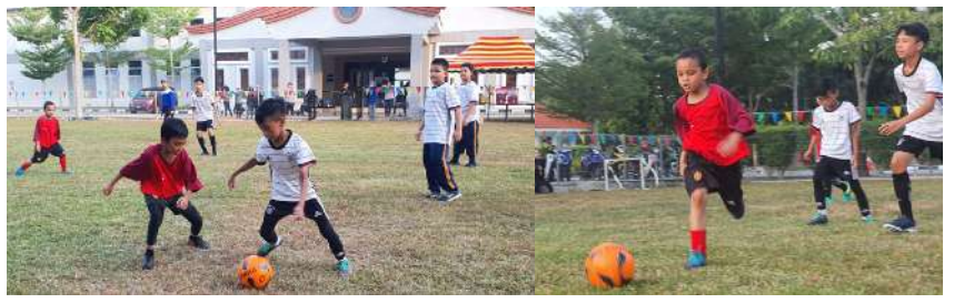
Students' Football Competition Score : Star City 4 - Dragon FC 1

STEM Department had the opportunities to do hands-on activities that apply the knowledge and skills from the fields of Science, Technology, Engineering, and Mathematics.