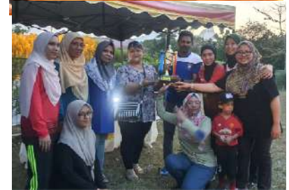
Netball Competition 1st Place: AIUIS Parents 2nd Place: AIU Students Team A 3rd Place: AIU Students Team B